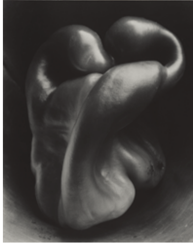
Edward Weston. Pepper No. 30, 1930.